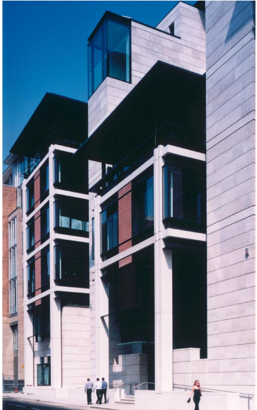
West entrance on Warwick Lane