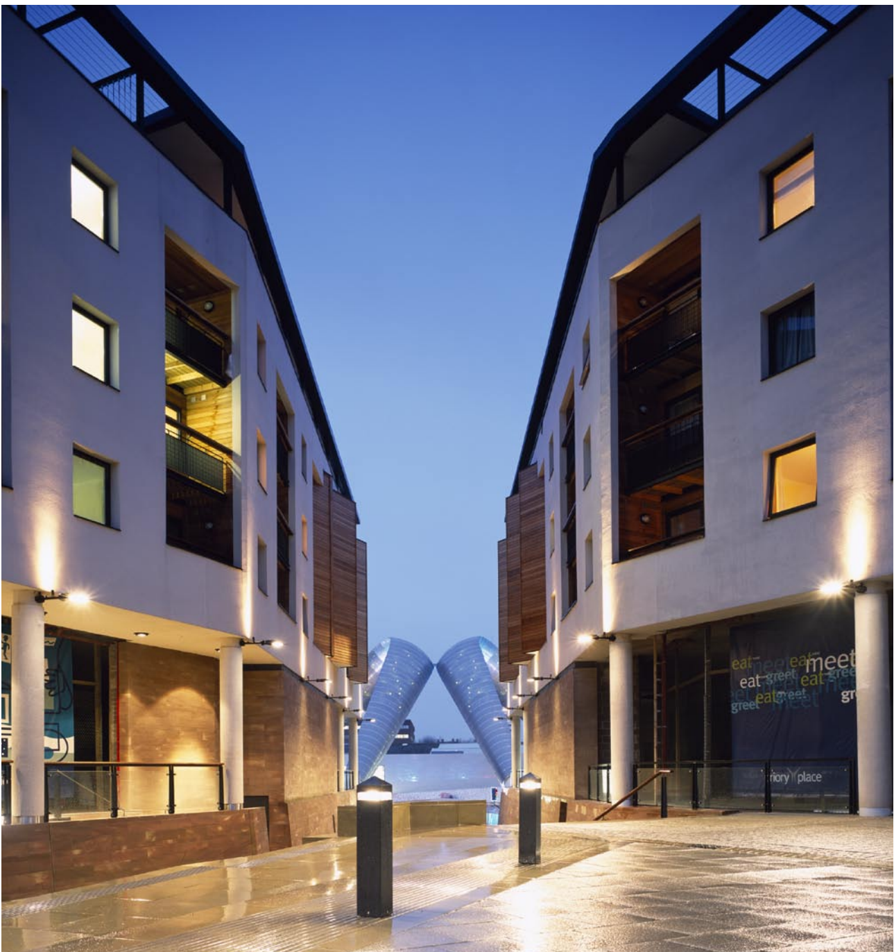
Priory Place looking towards the Whittle Arch at Millennium Place

The first three storeys of residential accommodation above are defined by a white render wall which is cut away to