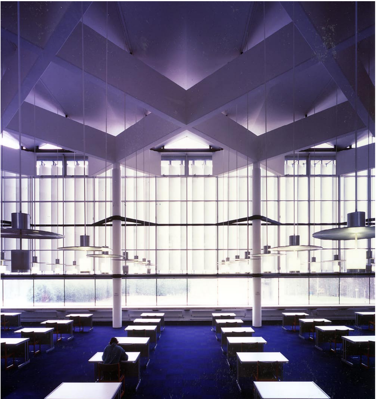
The double height reading room takes advantage of views to the horizon and Morecambe Bay

The raised floor contains all telecommunications and data cabling and acts as the air distribution plenum. The building is planned around a top-lit atrium, the location for noisier activities in the library. This arrangement frees the perimeter for quiet study. At either ends of the atrium are the archive area and the double-height Reading Room.