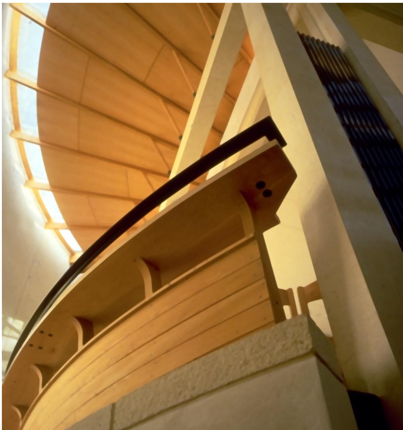
The design of the joinery enhances the form of the building

White concrete, oak and white render predominate in the chapel's interior. The concrete is finished in various ways, with a rough texture like rusticated stone at the lower level and, above, slender, highly-polished columns rising to support polished beams.