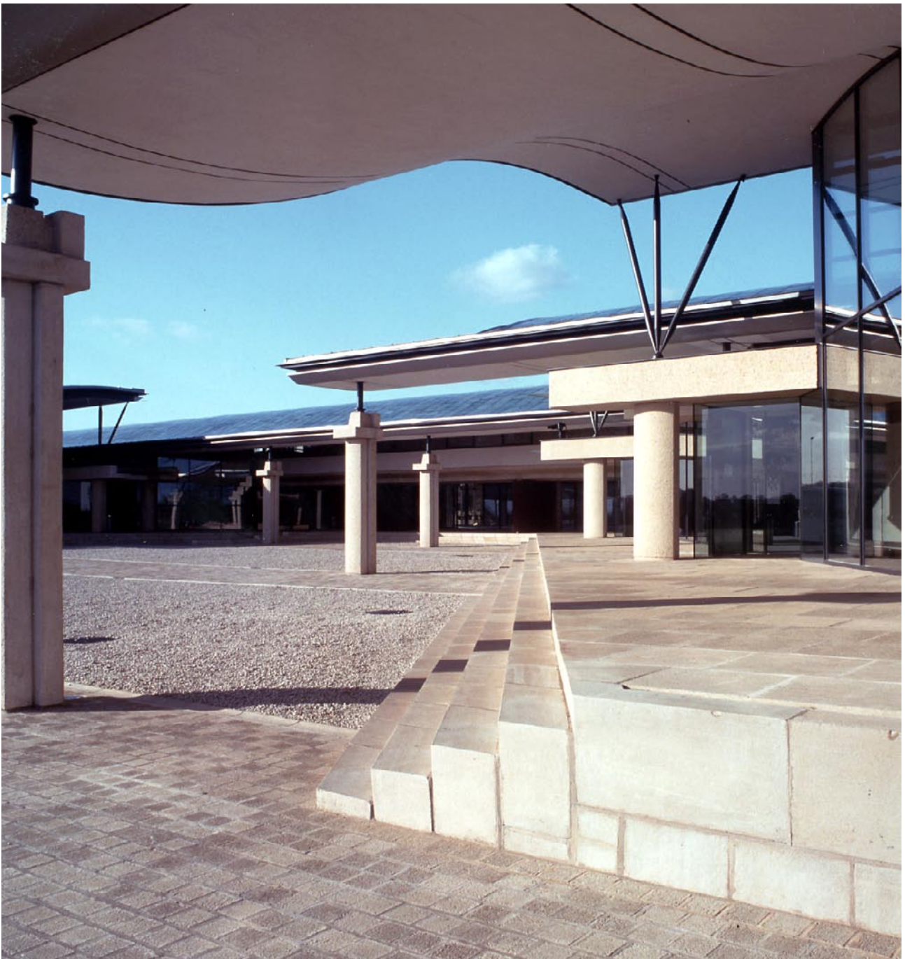
Wave form roofs to teaching areas form part of the environmental control strategy

We also managed and co-ordinated the fit-out of the building.