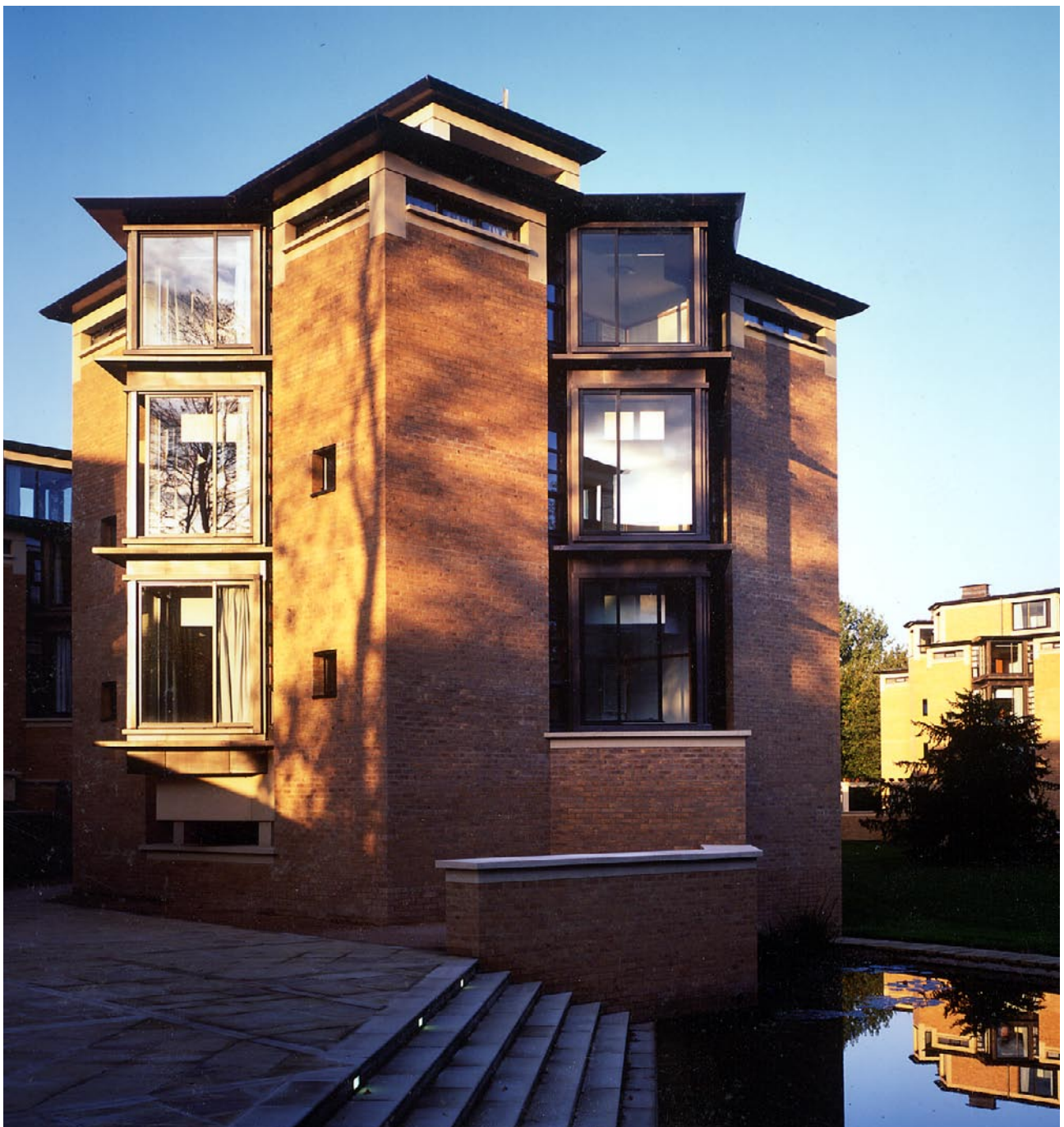
Interlocking brick and steel framed glass 'cubes' give the accommodation a special identity

The new buildings enclose the intensively landscaped site and control the access points for the development. They also overlook the principal external circulation routes to enhance security. The new accommodation is in the form of towers with staircase access to study bedrooms